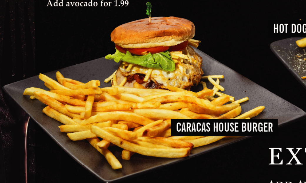
CARACAS HOUSE BURGER

HOT DOG 10.99 Topped with ketchup, mayo, mustard, potato sticks, onion, cabbage, Amarillo cheese, & Parmesan cheese. Add avocado for 1.99