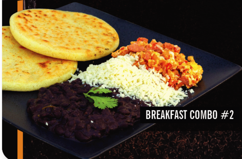
BREAKFAST COMBO #2