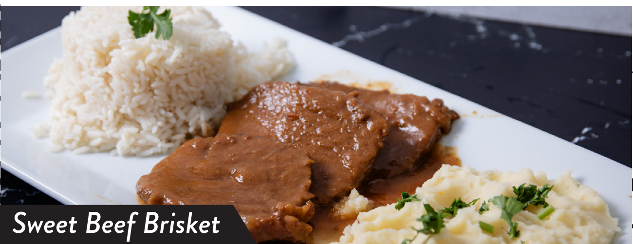
Sweet Beef Brisket