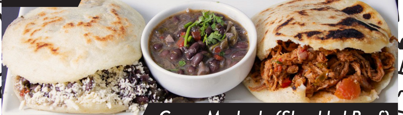
Carne Mechada (Shredded Beef)